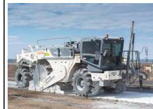
In situ mixing of binders