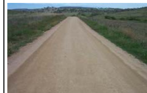
Stabilised unsealed pavement