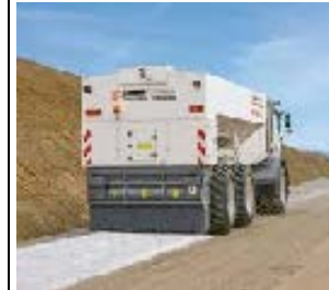
In situ application of binders